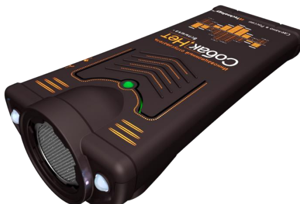
Figure 1. – Visual appearance of the device.

1.2.1. Visual appearance of the device is shown on Figure. 1.