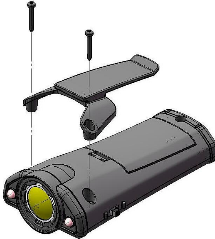
Figure 3 – Scheme of clip installation

1.4.3 Belt clip (item 8 on Figure 2) is designed for user convenience. It can be installed on the belt with the help of two self-tapping screws of extended length that are supplied in the package. Scheme of clip installation is shown on Figure 3.